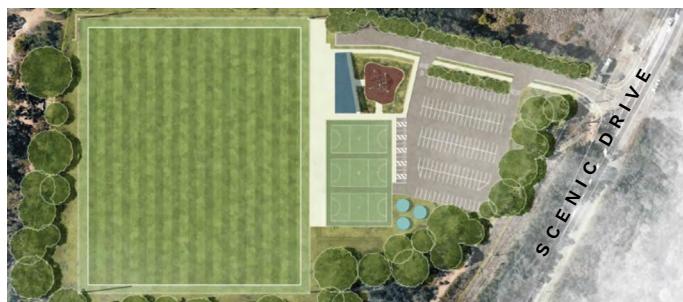
Concept design of the Colongra Bay Sports Complex

There have been many important milestones at Munmorah recently, and we're pleased to share a snapshot of the work underway to improve the site, support the local area and continue planning for its long-term future. Here are five key highlights.